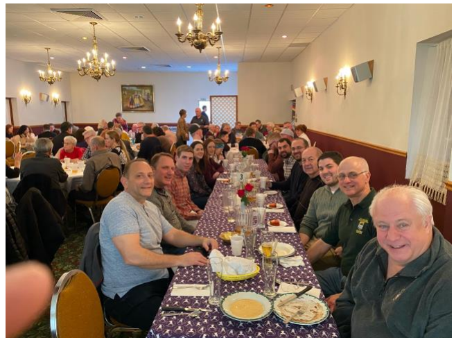
A great turnout for the Venison dinner!

We are looking forward to next year's venison dinner!