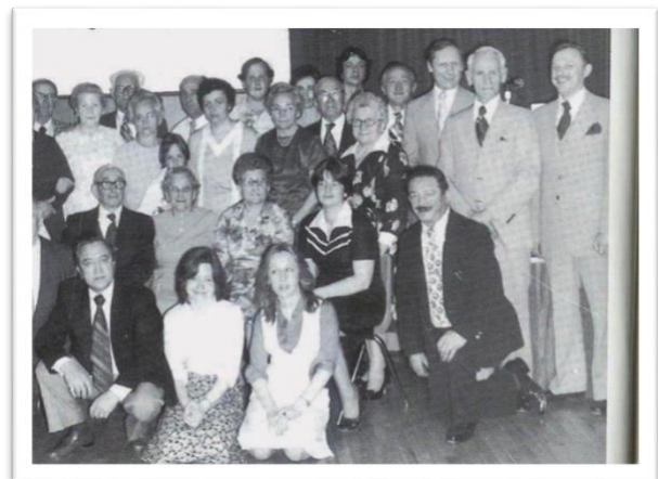
Filipowaer Kirchwei (1978)