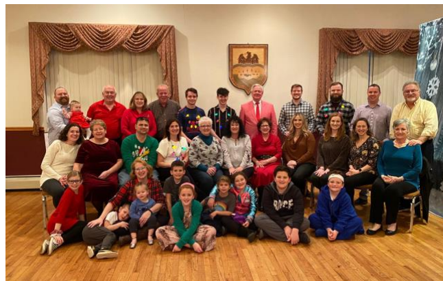
The Salmon family Christmas party

The Salmon family Christmas pollyanna party has outgrown a normal house party so they held it at the spacious upstairs hall.