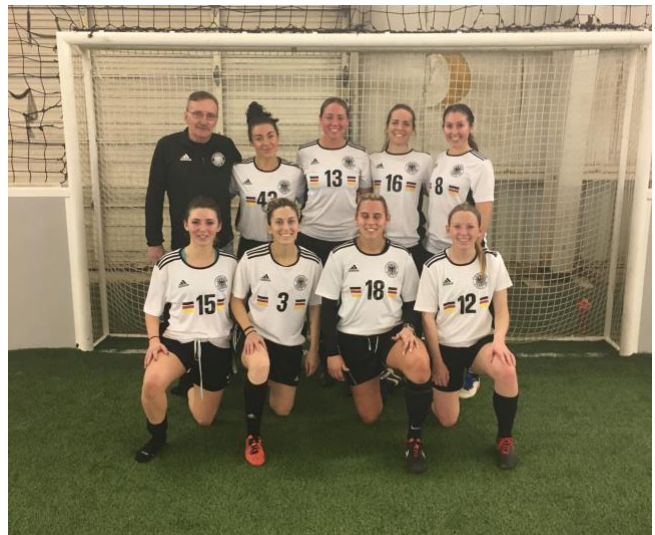
Danubia Women - "A" Division State Champions

We are also so proud of the Danubia women! They were back-to-back "A" division state champions!