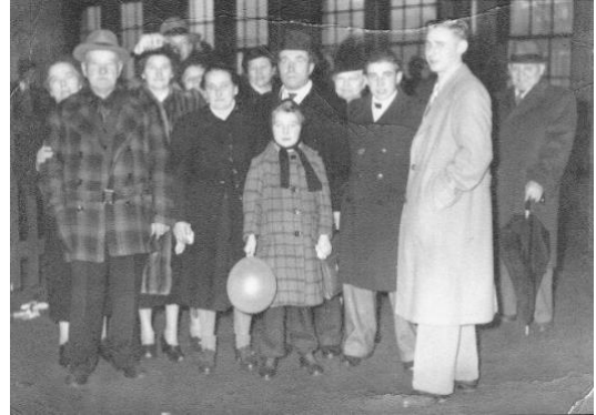
Relatives that I never know I had greeting us in New York Harbor