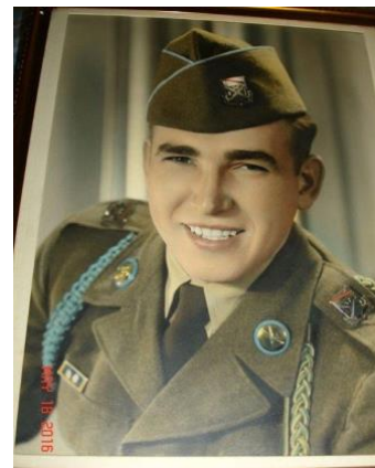
A proud American citizen