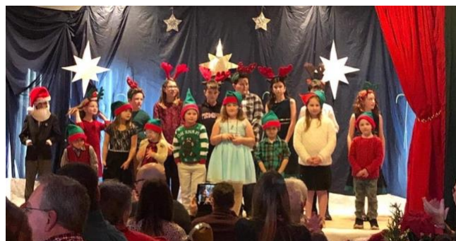
Guests enjoy the performance