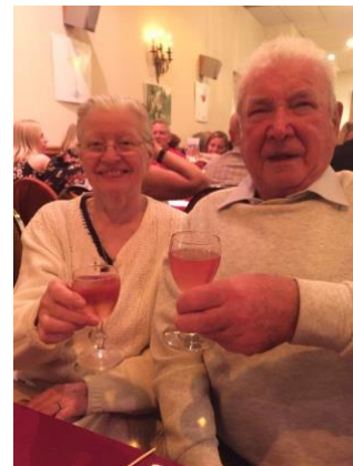
Prost to 70 years in America!

Note: This article was published with minor grammatical and formatting corrections to the original.