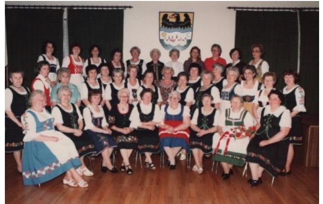
The Frauengruppe, likely in the 1980s

The following photos were shared by Roswitha Hoenisch. The first is of "The Frauengruppe" probably around the 1980s. The other pictures are of a "fashion show" of our home sewn dresses, possibly from 1973.