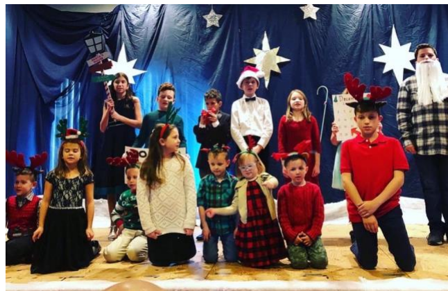
Another great Christmas show!

Then it was time for the show. With a total of 18 children, ranging in age from 2 to 12, there was a wonderful and lively program. They started their performance with a rousing rendition of the current hit "Baby Shark" but updated the words to singing Santa Shark as they danced their way up the aisle. There were a few more songs, a variety of poems, a violin solo, two ensemble songs, and finally, the Nativity scene. This year, the Nativity was a bit less traditional, told from the perspective of the many animals that visited Baby Jesus. Each of the children showed off their talents, and the parents, and especially grandparents, clapped with real enthusiasm. It was a wonderful start to the season.