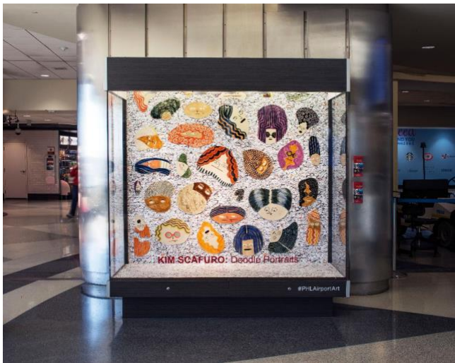
Artwork by Kimmy Scafuro

See more of her work at https://www.phl.org/at-phl/art-exhibitions/kim-scafuro .