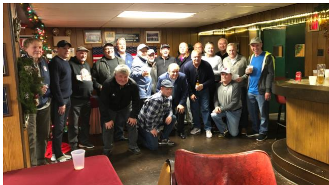
Major Men Soccer Reunion

Former Major Men's soccer players came together at the club after the Christmas holidays to again replay and embellish the goals and near misses of their careers. The storytelling went well into the night. It was agreed that this will be an annual event (to be held the first Friday after New Year's Day).