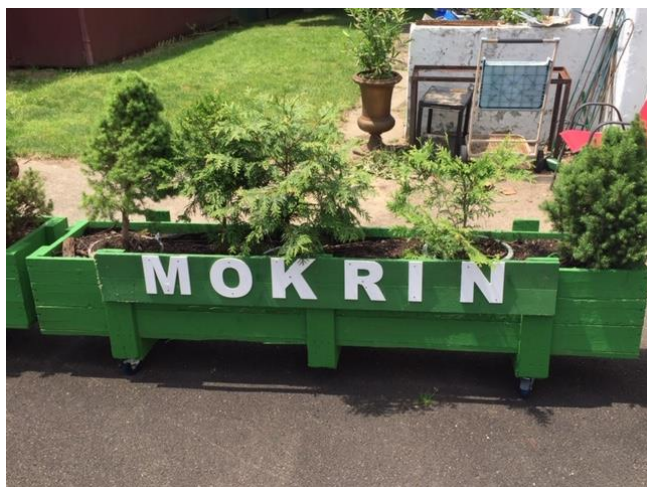
Flower box for Mokrin