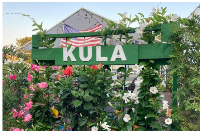
A close-up view of the Kula sign with flowers