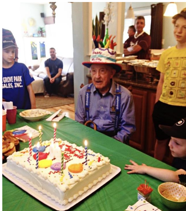
Celebrating with his family of three children, six grandchildren, and four great-grandchildren