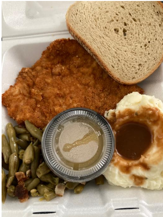
A generous portion was provided