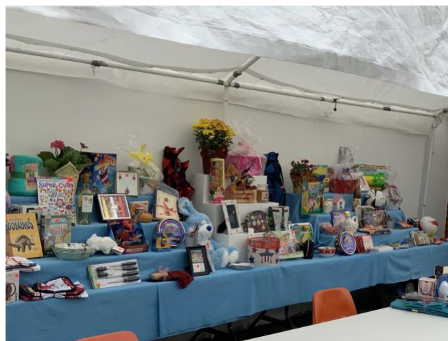
Ladies Auxiliary Verlosung table