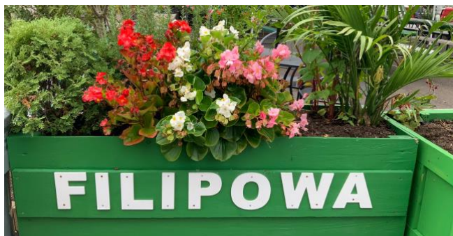
A planter box in the club's picnic area at the festival