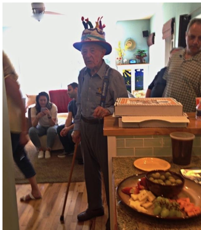
It was a surprise party