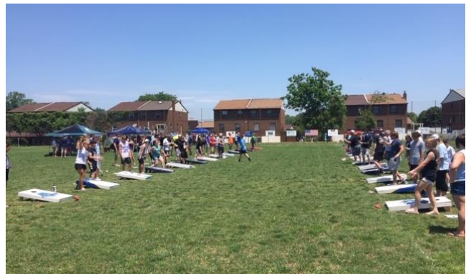
A great turnout at the cornhole tournament

During the summer the soccer program held a cornhole tournament along with a beer tower raffle. The soccer field was turned into a tournament setting with 36 competing teams. It was a huge success for the program.