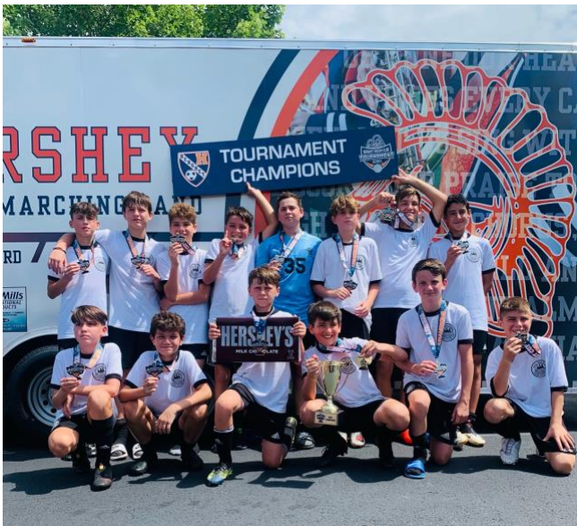
Danubia Gunners in Hershey, PA

The #7 ranked Danubia Gunners won the 2021 Hershey Cup in August to kick off the fall season.