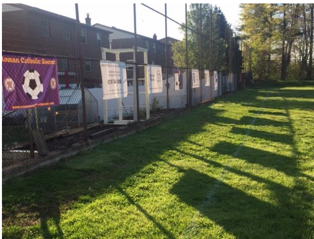
Banners hang by the soccer field

It's only taken 50 years, but the soccer program has finally decided to allow a professional to tackle the soccer field's grass condition – a lot of weeds. To date there have been 5 fertilizer applications with a final fall seeding to take place. No more excuses about field conditions will be accepted starting next spring for missed traps or missed goals. The cost of the treatments is being funded by the sale of advertising banners (3' x 5') along the soccer fence. To date twelve companies have purchased banners. If interested in supporting the field improvements, contact a soccer coach or board member.