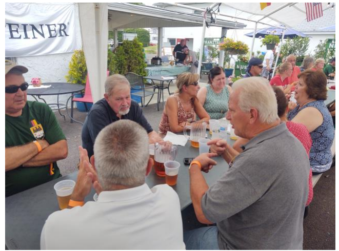
Enjoying a fine afternoon