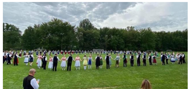
The Jugend participate in the friendship dance