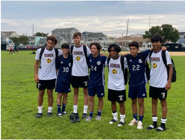
Danubia soccer players in Wildwood, NJ

The #7 ranked Danubia Gunners won the 2021 Hershey Cup in August to kick off the fall season.