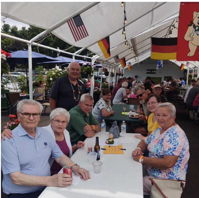
Guests enjoying themselves at the annual club picnic