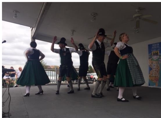
G.T.V. Almrausch dancers