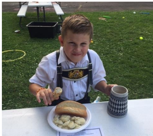
Enjoying a good German meal