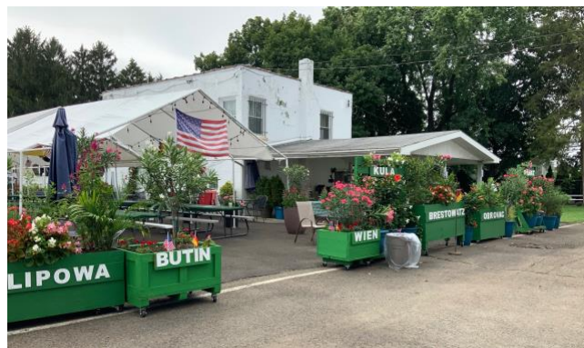
A view of the flower boxes in the club's picnic area