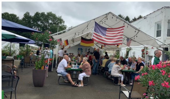
A nice afternoon at the festival