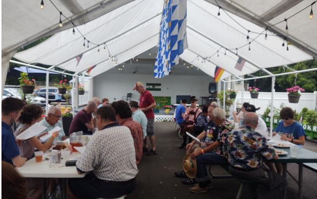
A great day to be under the tent

The club hosted its annual picnic and pig roast on Sunday, July 11. While it was a slightly lower turnout than usual, it was really nice to see so many familiar faces at the club again. Thank you to all the members and friends who attended and to all the volunteers who helped to make the event a success.